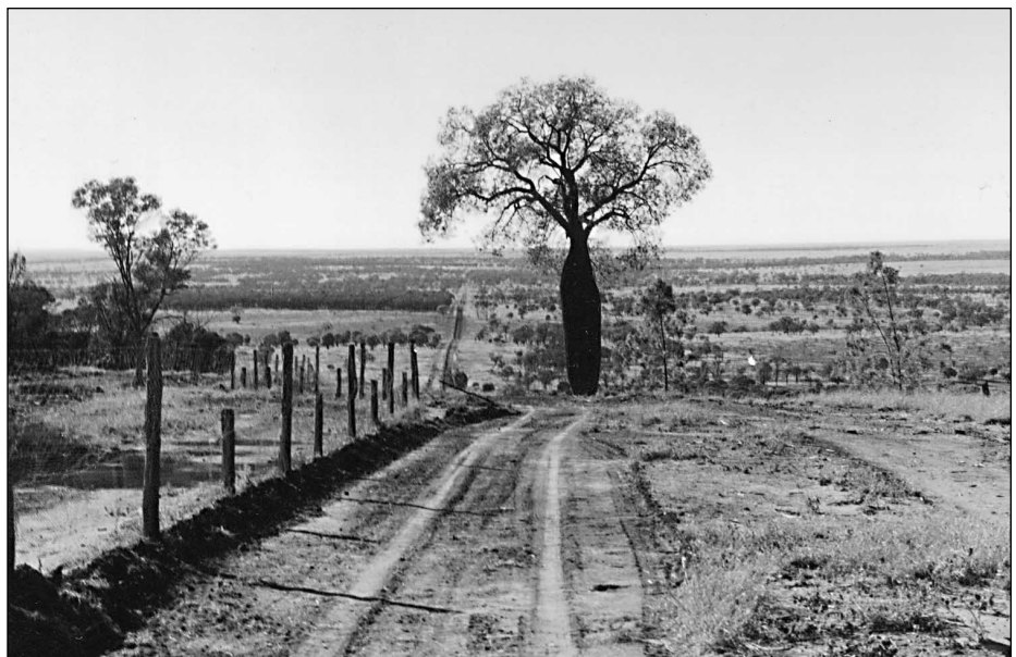
Figure 2. The Dingo Barrier Fence, a two-meter-high netting fence, stretches thousands of kilometers from Queensland to South Australia and encloses most of Australia's sheep production areas.

For four decades, baits poisoned with 1080 have been extensively used in Australia. They are placed in bait stations or along fence lines and property roads from vehicles, or alternatively,